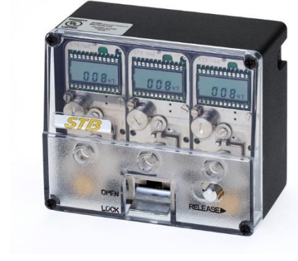
1600-2 or 3- Movements